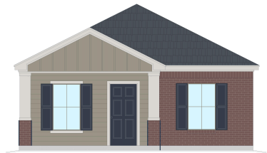
PLAN 2 - AR